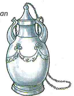
This Roman pot is full of oil.

Then they would scrape off the oil with special scrapers made of metal, wood or bone. These were called strigils. Some people had their slaves do the scraping for them.