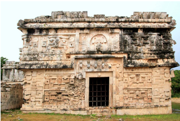
Stone engravings at Chichen Itza.

"When I first walked in to the site through Mayaland's private entrance it surprised me how although you were moments from a hotel, it seems like worlds away. It's mind boggling to think that an ancient civilisation was able to pull off the engineering required for such an impressive structure. I could stare at it for hours – in fact I think I did."