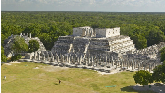
The Temple of the Warriors