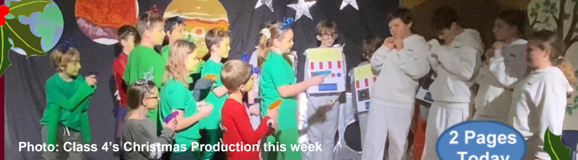
Photo: Class 4's Christmas Production this week

Mon 13 – Saints After School Clubs booking link 10 th , 13 th & 15 th - Christmas Performance links