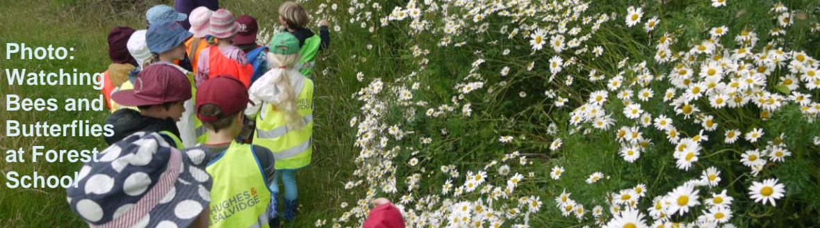
Photo: Watching Bees and Butterflies at Forest School