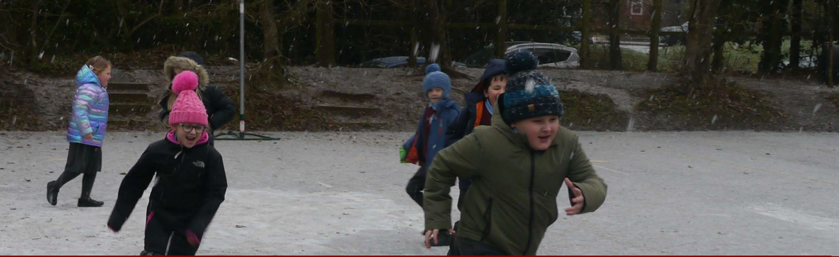
Photos: Children enjoying the snow on Tuesday – a fun first day back!