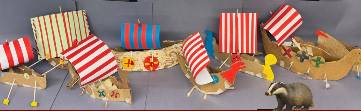
Photos: Viking Longships Created by Badgers (Y5&6) Collaboratively in DT this week.