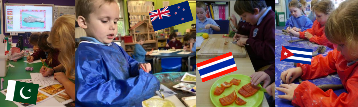
Photos: Multicultural Week Dormice New Zealand, Squirrels Cuba, Hedgehogs Thailand & Badgers Pakistan

It's been multicultural week in school this week and the children have been busy learning about aspects of other cultures. This has involved geographical work with maps to understand features and key settlement, work in RE to explore religious beliefs and associated cultural practices, listening to traditional stories, artwork related to key themes and also cookery to explore some of the tastes. Squirrels also did some dancing! Hopefully they are able to share some of their experiences from this week with you – an example of the 'open your mind' part of our vision, where children explore a very contrasting way of life to their own.