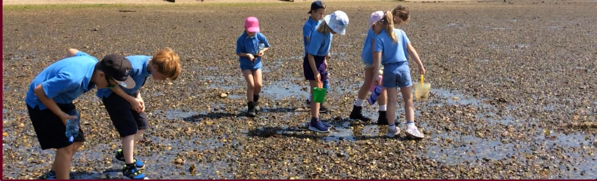
Photo: Hedgehog Class at Lepe Beach searching for biodiversity

Wed 25 Jun – pm Sports Day 1pm start Thurs 26 Jun – pm playtime FUS Lollies (for those booked) Sat 28 Jun – Upham Village Fete Tues 1 July – pm Reserve Sports Day Tues 8 July – Wyvern Y6 new intake day Wed 16 – Fri 18 July – Badgers (Y5&6) Residential visit Mon 21 July – 13:45 Y6 Leavers Service Tues 22 July – Last Day of Term