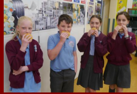
Photos: Year 6s enjoying a dance session before school and bacon rolls mid-morning!

This week has been all about Year 6 and SATs week, mainly because we have to use the hall for the tests which means every other class has to stay in theirs and be quiet. The children worked really hard. After every test we asked them if they felt they had done their best – that's all we can ask (they all agreed!). These are the first formal exams the children will experience so it's important to us that their experience is positive; that they realise that if you prepare sensibly then you can overcome any nerves. Having now finished them they've proved to themselves they can do it. This self-confidence is an important life lesson; we all have moments in life that make us nervous, such as job interviews for example, but can cope with the feelings.