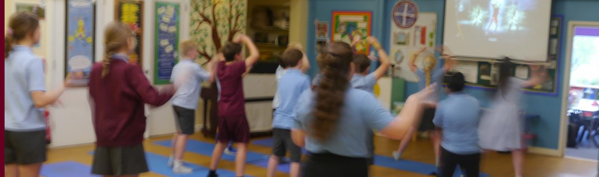
Photo: Badgers (Y5&6) enjoying some fun dance before school this week