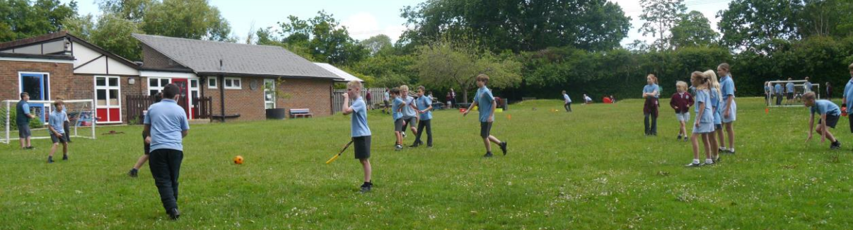
Photos: Boys and girls enjoying playing football, during one of the drier moments this week.