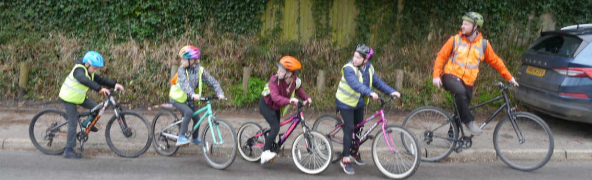
Photos: Year 5 on Bikeability, learning road safety

Year 5 children have been taking a cycle proficiency course this week – you might have seen them arriving with bikes or out and about cycling. They worked with Hampshire Bikeability Trainers, initially on the playground to practise control. They then progressed to going out to Upham Street, to learn how to follow the highway code and safely make a push off start and negotiate hazards such as parked cars. They then cycled up and down the hill and used some of the junctions to practise how to turn left and right. This is really important learning for all of them to understand how to safely cycle as a ‘road user’ as well as really good exercise too – I’m sure they all slept well afterwards!