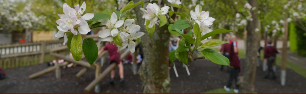
Photos: Apple Blossom around school